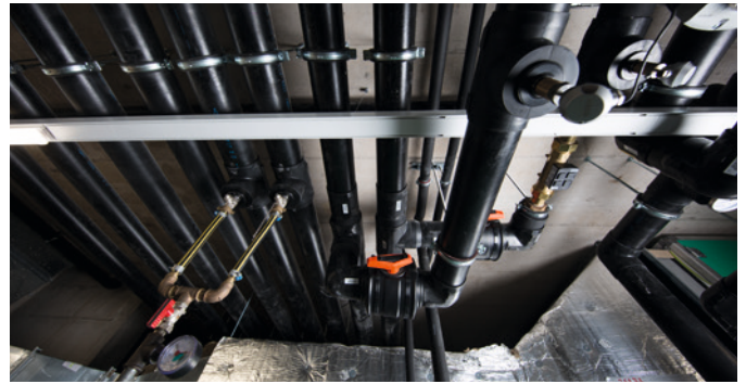
COOL-FIT 2.0 in use in the Training Center at GF Piping Systems.

With the disconnection of the building containing the Training Center from the company's adjacent plant, there will be an improvement in temperature conditions. The installation time of the piping systems of the entire building for heating, drinking water and cooling lines with COOL-FIT 2.0 could be reduced by 50% thanks to the pre-insulated components, the low weight and the fast electrofusion connection. Energy savings of around 30% are expected at the Training Center, which would be a further contribution towards resource savings for the sustainably managed company.