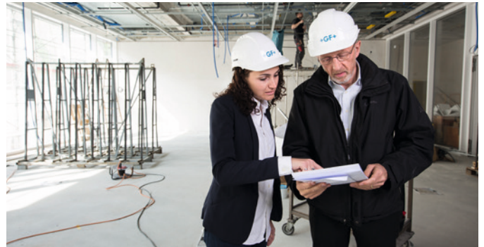
Employees of GF Piping Systems check the installation.