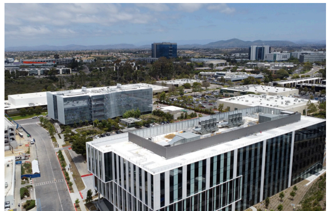
Water Works, Inc. chose the AquaTap for this installation specifically to maintain high purity all the way to the point of use.

For more information about AquaTap, please either scan the QR code or click here .