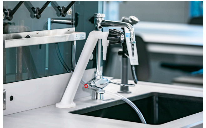
GF AquaTap™ recirculating laboratory faucets installed in combination with In-line flow diverter (IFD) eliminate dead-legs at all points of use to maintain purity throughout the DI water.