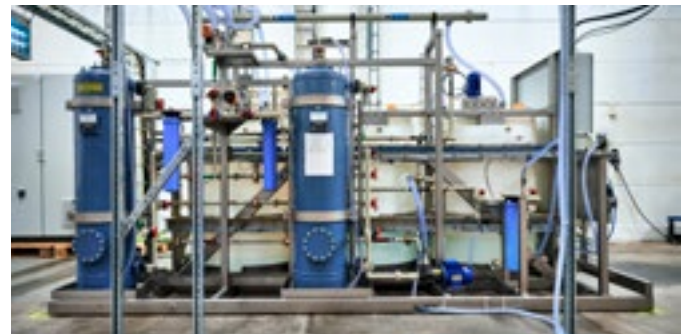
The valves and sensors work together seamlessly to meet the high demands of the cleaning and stripping process.