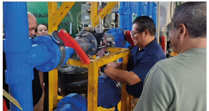
Thanks to its compact body design the valve is up to nine times lighter and can decrease installation time by up to 40% compared to a standard metal PRV.