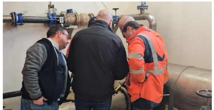
With technical support by GF Piping Systems, the ageing cast iron PRV was successfully replaced with NeoFlow

The installation of the NeoFlow PRV was completed in two hours, including the challenging dismantling of the cast iron valve. The predetermined settings worked well and only had to be adjusted slightly. Finally, Noreade performed a fire flow test by opening two hydrants. NeoFlow was able to support the maximum capacity of the pumping station at 165m 3 /h with a pressure drop of 0.5 bar that is to be expected at 100% opening. In addition to the technical advantages of NeoFlow, Noreade also benefitted from project support by GF Piping Systems.