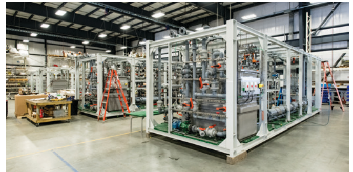
The Canadian company Saltworks Technologies Inc. specializes in water treatment skids and container solutions.

Telephone +41 (0)52 631 11 11 mail@georgfischer.com www.gfps.com