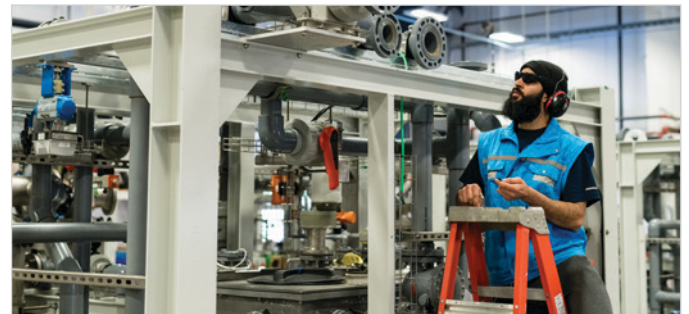
GF Piping Systems provides customized and reliable solutions for process automation.