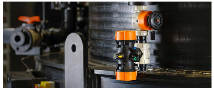
Components such as the plastic Pneumatic Actuator Type PPA are part of a fully compatible ecosystem and give operators full control over their installations.