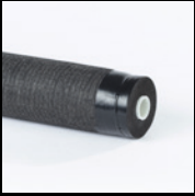
Pre-insulated multilayer pipe