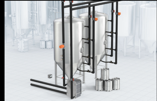
Process cooling in food & beverage and industrial productions.