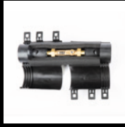
Flow control valve