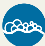
Foaming 1 & Agitation