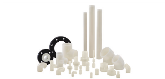
The SYGEF ECTFE product range includes pipes, fittings and the necessary jointing technology.

The SYGEF ECTFE system enables reliable and safe transportation of chemicals with a pH value of 0 to 14. The combination of SYGEF ECTFE components with the latest IR welding technology ensures a tested connection and offers the highest level of safety for people, the environment and the production process. These properties enable the optimum use of ECTFE in segments such as the chemical process industry, water treatment and microelectronics.