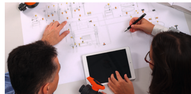
GF Piping Systems offers comprehensive project support with regard to chemical resistance, choice of material, installation and jointing technology.

Compared to widely used PFA solutions, ECTFE is also characterized by optimum permeation and strength properties.